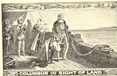
COLUMBUS IN SIGHT OF LAND